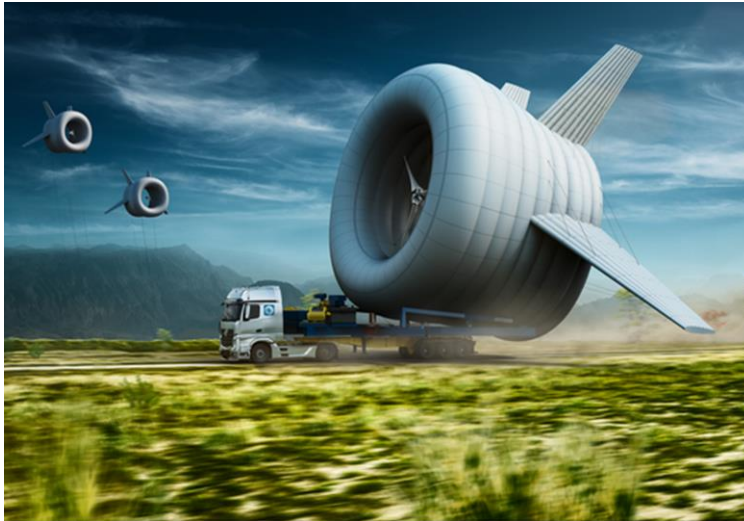
Figure3. Altaeros Energies horizontal buoyant turbine [10]